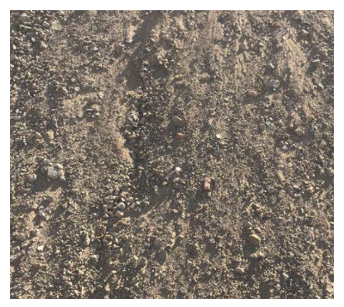
Figure 1 Input for Blu-Core G7 Filling